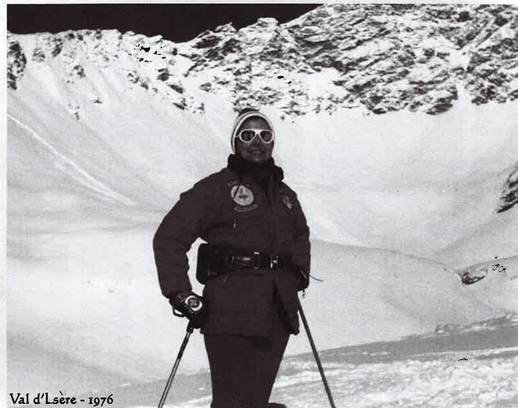
Val d'Isère - 1976