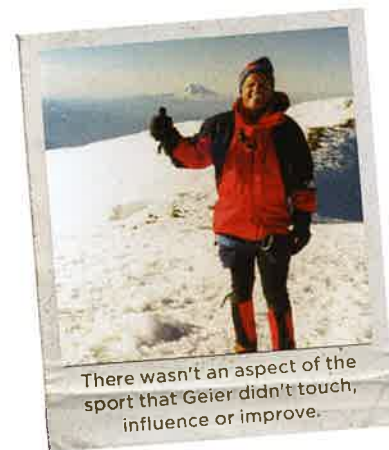
There wasn't an aspect of the sport that Geier didn't touch, influence or improve.