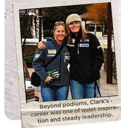
Beyond podiums, Clark's career was one of quiet inspiration and steady leadership.