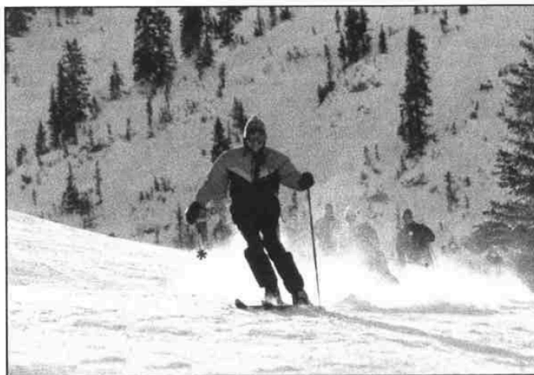
Teaching Seniors, 1995