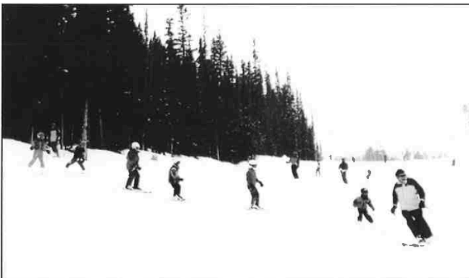
Jerry Grosword with 6 of 7 grandchildren, March 2001