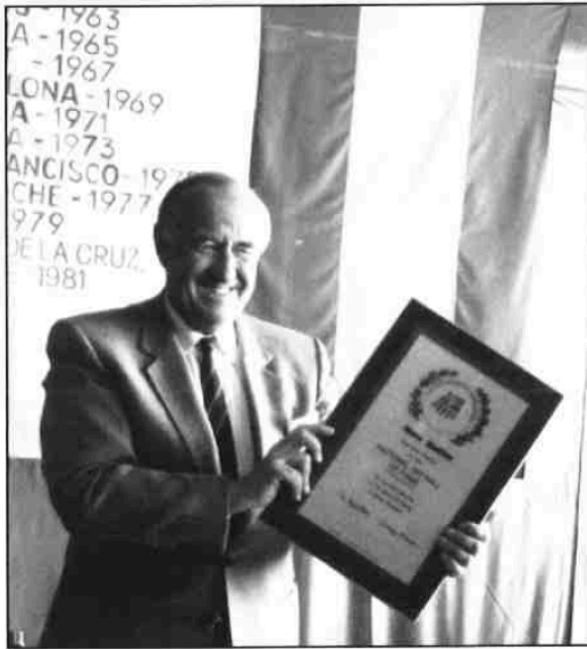
Marc Hodler holding his U.S. National Ski Hall of Fame induction plaque.

active in skisport turning his attention to technical and administrative activities.